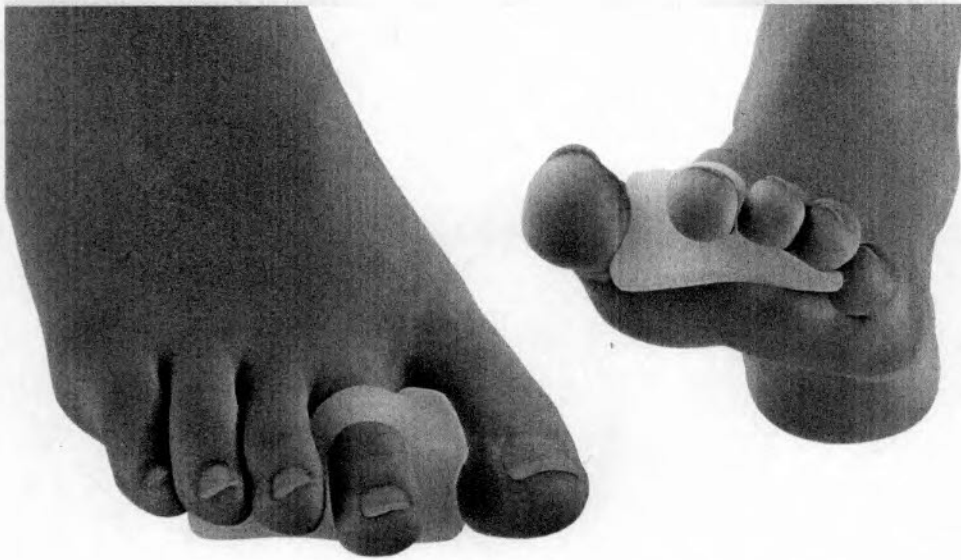
Spacer separates 1st and 2nd Toes